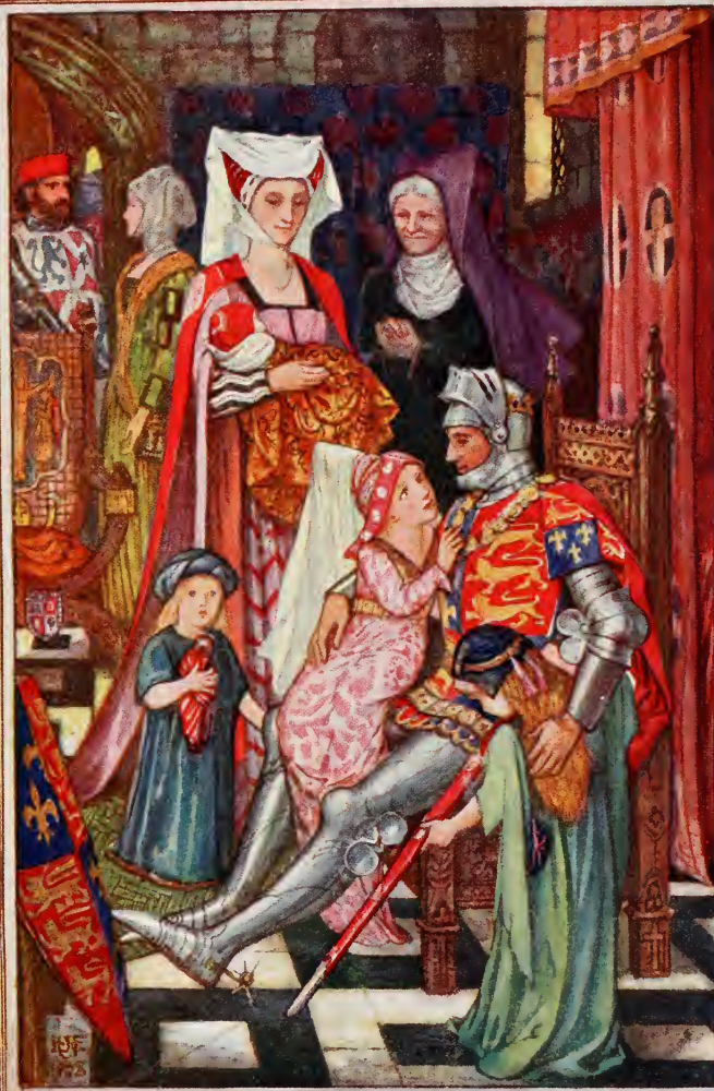
You are the first King who has entered sanctuary